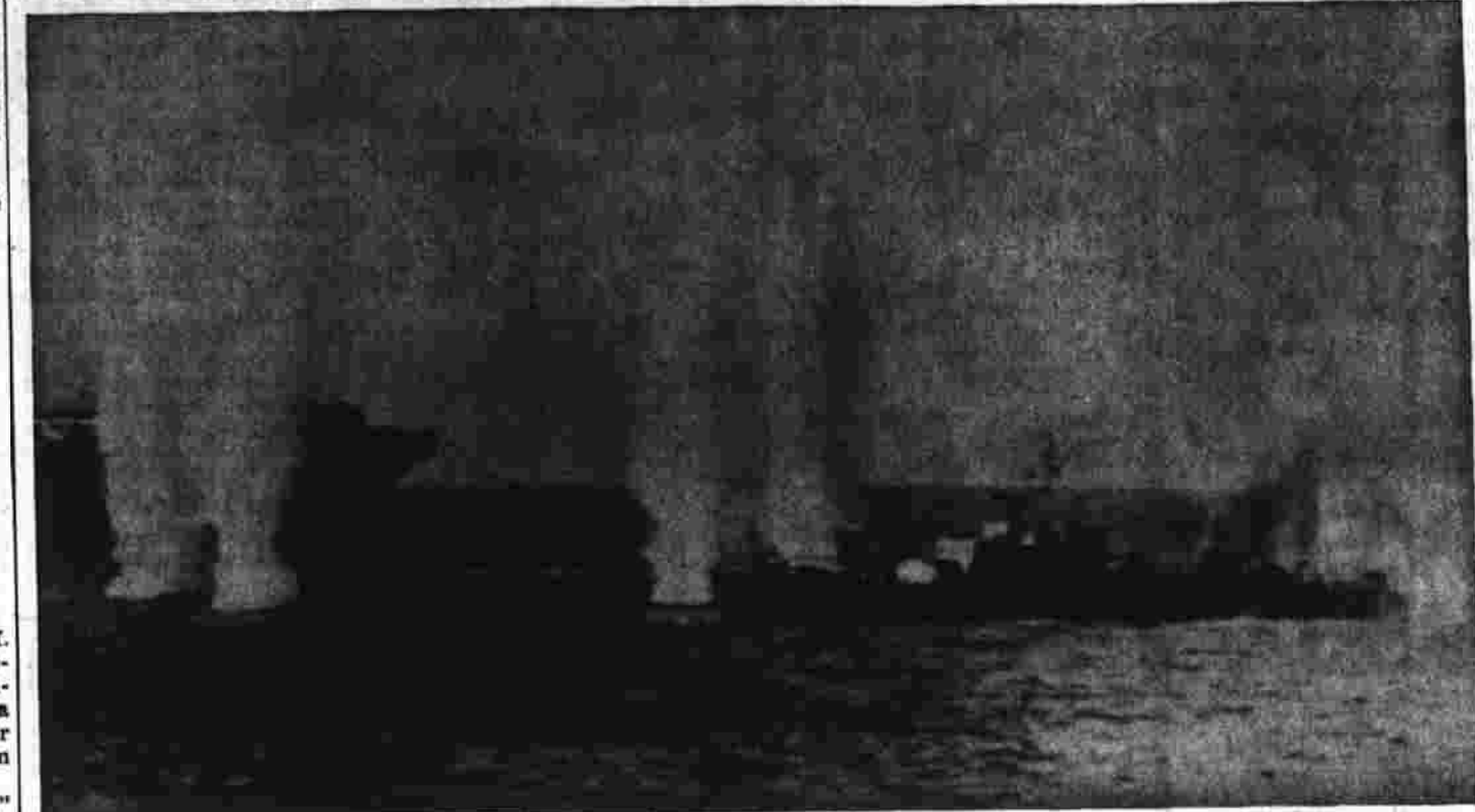
Water spurts up around a Greek Cypriot patrol boat in Xeros Harbor. The craft was hit by Turkish Air Force jets during weekend attacks in northwest Cyprus. Freighter anchored at left was awaiting a cargo of ore.