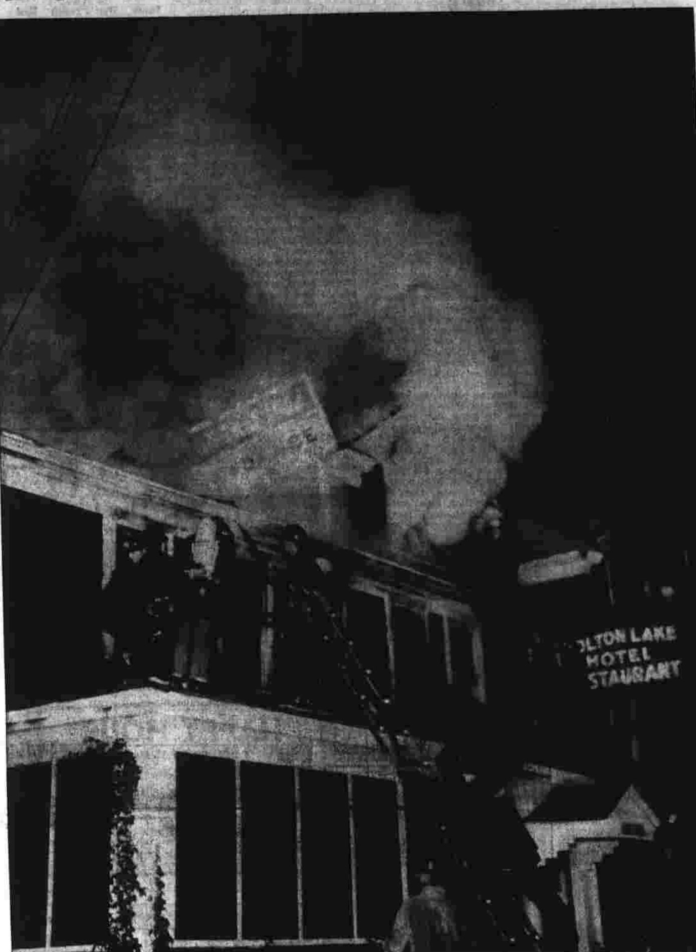
Firefighters battle early morning blaze at Bolton lakeside hotel.